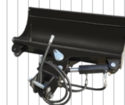
800 mm Hydraulic bucket