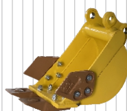
200 mm Bucket