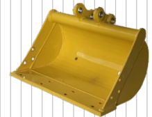
500 mm Bucket