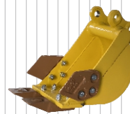
200 mm Bucket