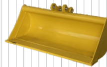
800 mm Bucket