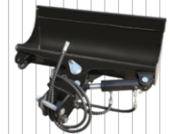
800 mm Hydraulic bucket